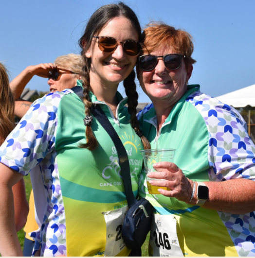
Member of team CWC at the Second Summer Cycle fundraiser finish line in Provincetown - we raised $11,565!