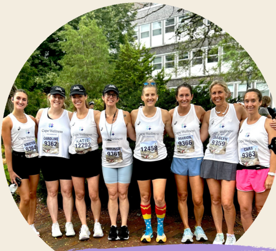
Members of Team CWC at the Falmouth Road Race fundraiser - we raised $17,401! Can't wait for next year!